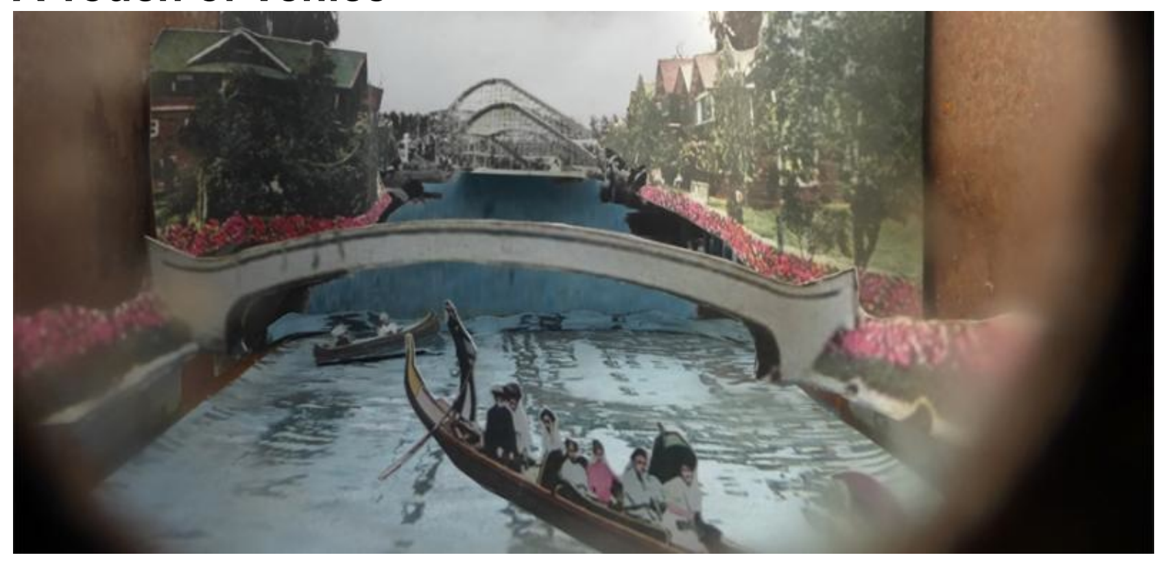
Inside the "Take a Peek"